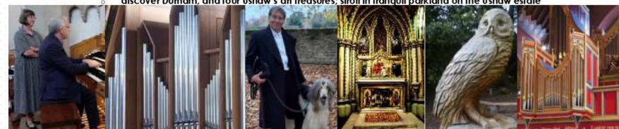
TUTORIAL AT J'S AND B'S PHELPS ORGAN, HEXHAM ABBEY JAMES PARSONS ARTWORKS AT USHAW NEWCASTLE RC CATHEDRAL

£190 covers full participation: tuition, recitals, brunch; (NDSO- and ORGAN CLUB members £165);