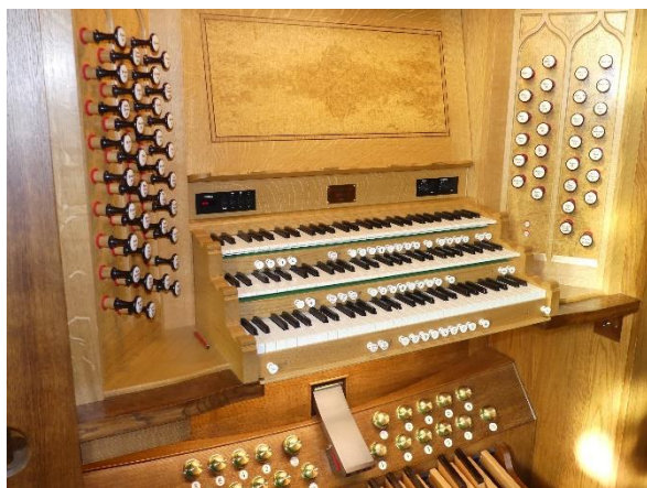
The organ console at Radley College Chapel.

To Didcot: 16:13, 17:13, 18:13, 19:13, 20:15 - takes about 10 mins