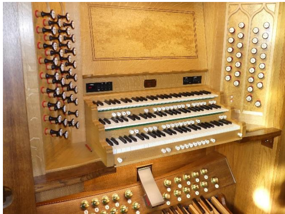
The organ console at Radley College Chapel.

To Didcot: 16:13, 17:13, 18:13, 19:13, 20:15 - takes about 10 mins