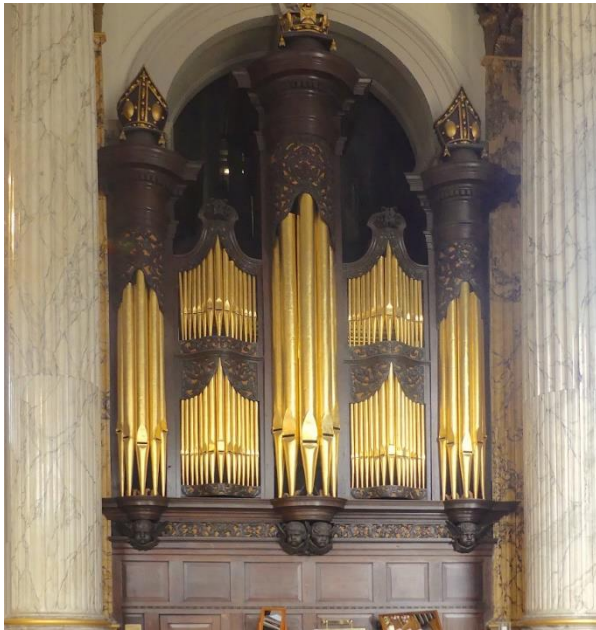
Swarbrick case in St Philip's Cathedral B'ham