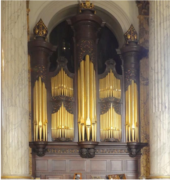
Swarbrick case in St Philip's Cathedral B'ham