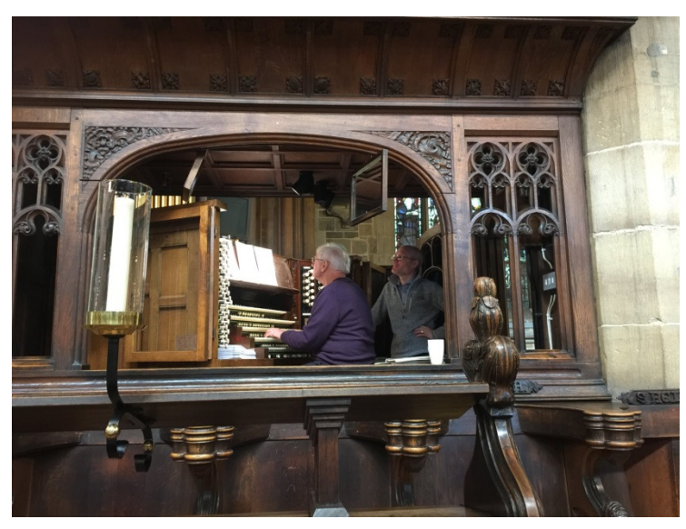
Newsletter editor at the console of the 5-manual organ at Wakefield Cathedral